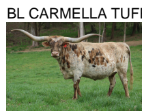
BL CARMELLA TUFF