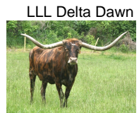
LLL Delta Dawn