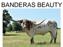
BL BANDERAS BEAUTY 184