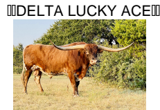
DELTA LUCKY ACE