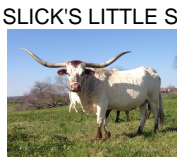
SLICK'S LITTLE STAR