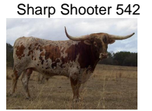
Sharp Shooter 542