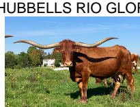
HUBBELLS RIO GLORY