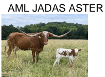
AML JADAS ASTER