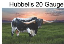
Hubbells 20 Gauge