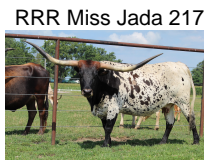
RRR Miss Jada 217