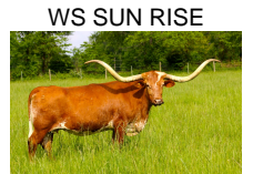
WS SUN RISE