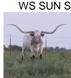
WS SUN STAR