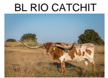
BL RIO CATCHIT