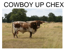
COWBOY UP CHEX