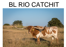
BL RIO CATCHIT