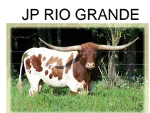
JP RIO GRANDE