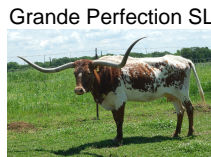
Grande Perfection SL