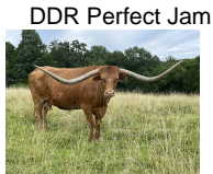
DDR Perfect Jam